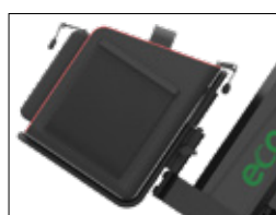
Bag (incl. bracket holder)

Weights designed to provide optimal traction in demanding situations. These weights, approximately 10 kg in total, can be adjusted to 7.5 kg or 5 kg to suit your needs